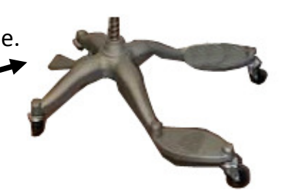
Step 3: Insert the spring over the Inner Pole until it is sitting on the base.

Test: Step on foot pedal, you should feel some resistance. (The Pole should not move)